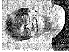
PHOTO MUST BE IN HIGH-RESOLUTION (300 dpi or higher) ELECTRONIC FORMAT. No cellphone photos. No laser printer copies.

Please photograph your nominee in a neutral setting for the Outstanding Performer yearbook. Example: